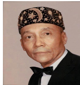
The Honorable Elijah Muhammad Messenger Of Allah

Messenger Muhammad advises that our vote is strong and powerful when used to put a white person in place, but we